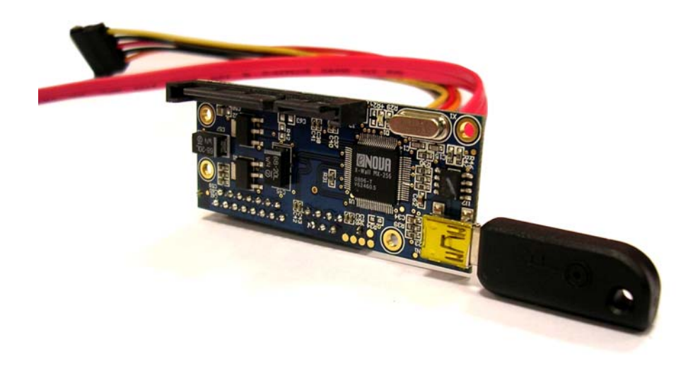
Figure 3. The MX dongle board is affixed with a standard SATA 22-pin cable to the host and an Enova mini-USB type key fob to the socket in Zone C.